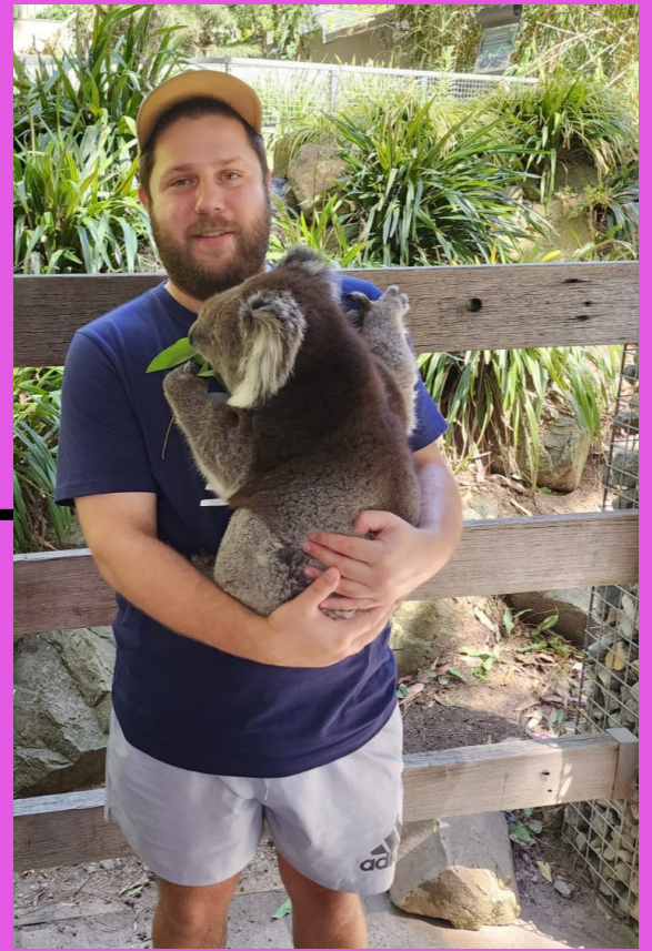
Dlyan Jan 2023

All of our support staff have graduated from Disability Skill Set or Certificate III in Individual Support and hold a current First Aid Certificate. We also have Registered Nurses available for clients with more complex needs.