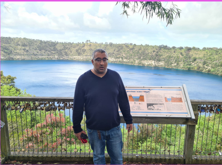
SUNNY 2022 MT GAMBIA